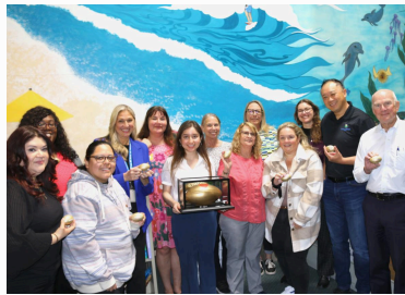
Ventura County Library MEDIUM DIVISION