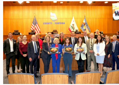
Board of Supervisors SMALL DIVISION

CLICK TO WATCH: We Make A Difference - 2026 WeGive