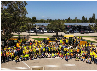
Ventura County Public Works LARGE DIVISION