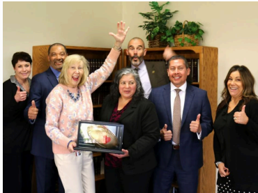
Ventura County Superior Court LARGE DIVISION