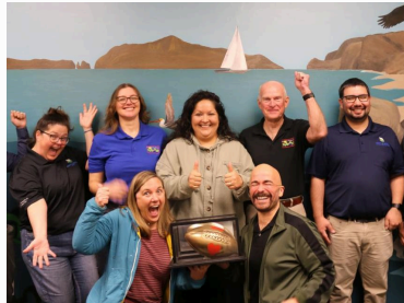
Ventura County Library MEDIUM DIVISION